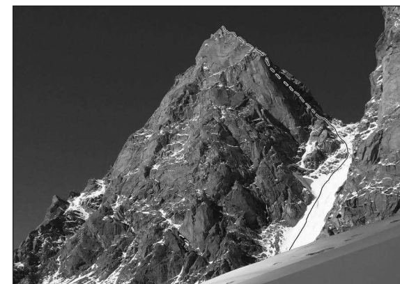
Om Shanti Peak (5,770m GPS) above the upper Takdung Glacier, showing the line of the first ascent via the south couloir to southeast face.