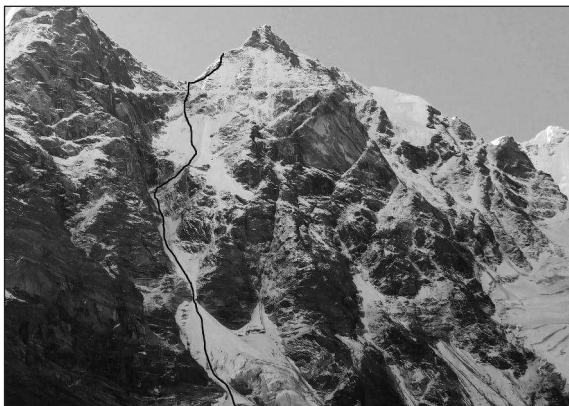
The northwest face of Ogre II (north summit on left; south summit to the right), showing the line of Ice on the Rocks to Col 5,630m, and then part way up the north ridge of Ogre II south summit.

The route, named Ice on the Rocks, is more than 1,200m long and in the lower part consists of two 85° icefalls and some technical 70° gullies. It continues with a dangerous hanging snowfield followed by mixed terrain (85°, UIAA V+). After reaching the col at 5:30 p.m. the three climbers started up the northwest ridge of Ogre II's south peak but gave up due to the late hour and the threat caused by windslab and unstable snow. They reversed the ascent route and were back in camp at 11 p.m. after a grueling 18-hour day. Daniele De Candido, Attilio Munari, and Riccardo Scarian operated in the upper Chhudong. On September 12 they reached the previously virgin southwest summit of Triple Crown, a three-summitted mountain, the highest point of which had been climbed the day previously by Australians Natasha Sebire and Gemma Woldendorp [see below]. Looking from the upper Chhudong, Triple Crown is the fourth peak to the left (north) of Neverseen Tower. We named our new summit Bruno Detassis Peak (5,760m, N 33°05'12.95", E 76°53'08.10") after the Italian mountaineer who died earlier in the