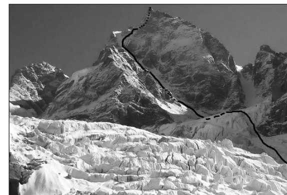
Trento Peak (6,046m GPS) above the upper Takdung Glacier, showing the line of the ascent: southeast face to northwest ridge to (hidden) north face.

On the 11th, Corona and Groff climbed another previously virgin peak that they named Om Shanti (5,770m, N 33°04'42.45", E 76°54'21.66") meaning "mountain of peace" in Hindi. This lies a little west of Trento Peak (but is separated from it by a fine, unclimbed rocky